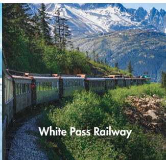
White Pass Railway